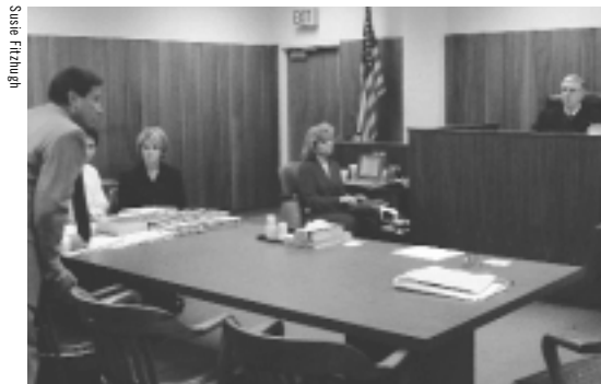
Judge James Morris, Presiding Judge of the Juvenile Court and leader of Sacramento's Juvenile Justice Initiative in 1996 and 1997, conducting a hearing. Judge Morris built the consensus necessary for Sacramento's "detention early resolution" program to succeed.

Sacramento already had such a body, the Criminal Justice Cabinet created in 1992, which proved to be a powerful force for collaboration. The Cabinet, composed of the heads of all agencies with criminal justice responsibilities, met once a month to consider proposals and problems across the spectrum of criminal justice. The breadth of representation and the clout of its membership combined to give a lot of weight to its decisions.